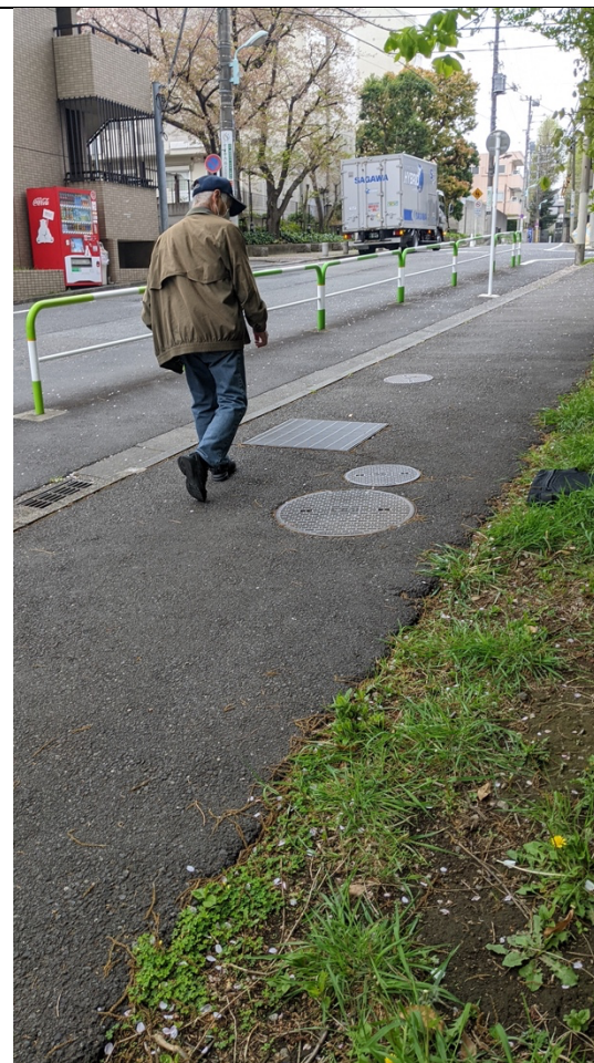
These pictures are before I became fully unconscious on the side of the street.

The police in Tokyo Japan practiced refugee persecution by not taking me to the hospital with clear proof that I was physically ill with multiple sclerosis. I couldn't even see the police officers or stand up without falling down rapidly, I had dyskinesia in neurology terms.